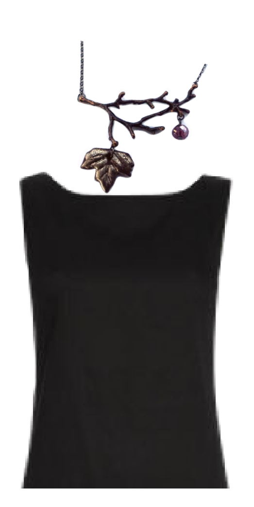
- BOATNECK choker