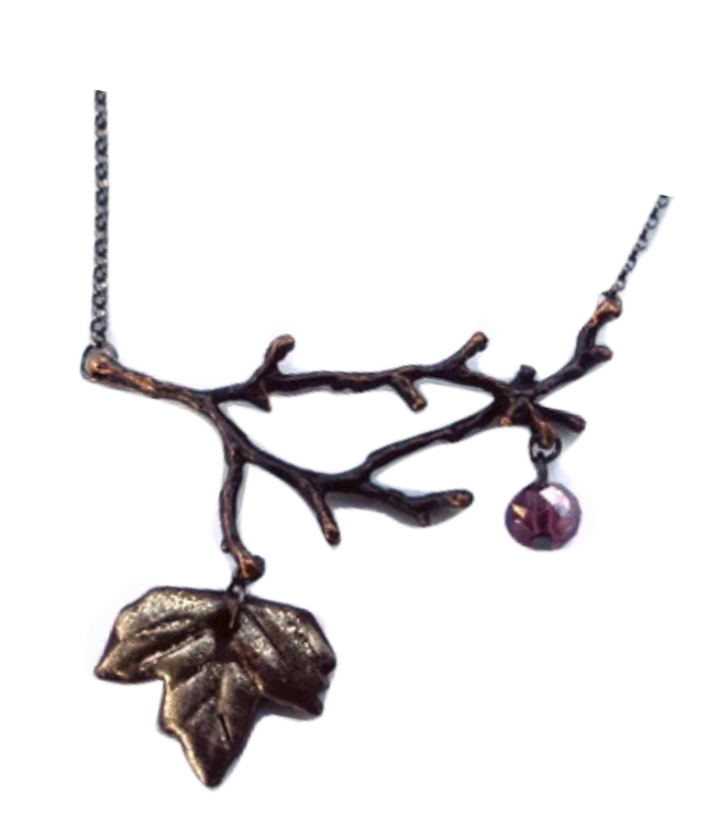
Amethyst Leaf & Twig Necklace Harvest Collection $69