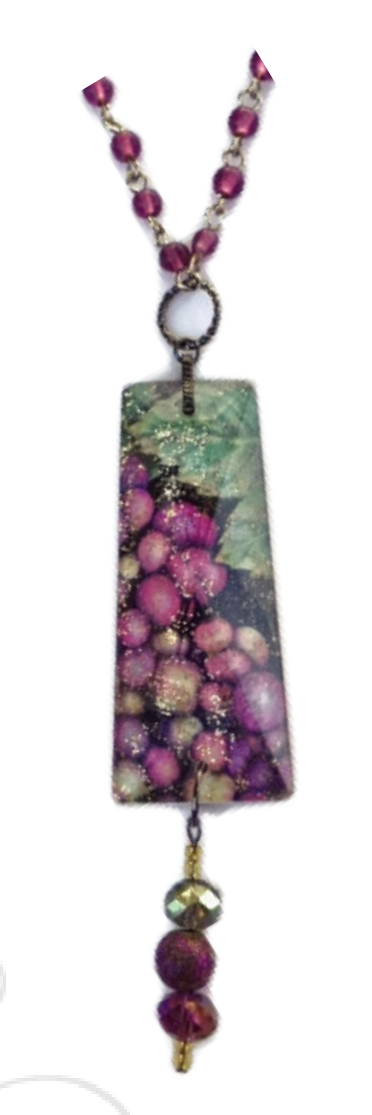
Pinot Grape Crystal Crystal Collection $119