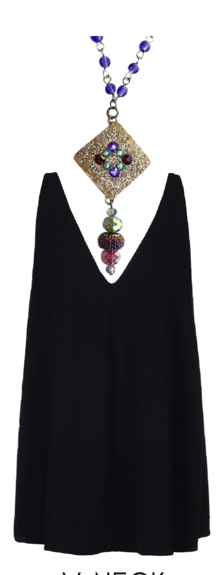
- V-NECK short v-shaped pendant