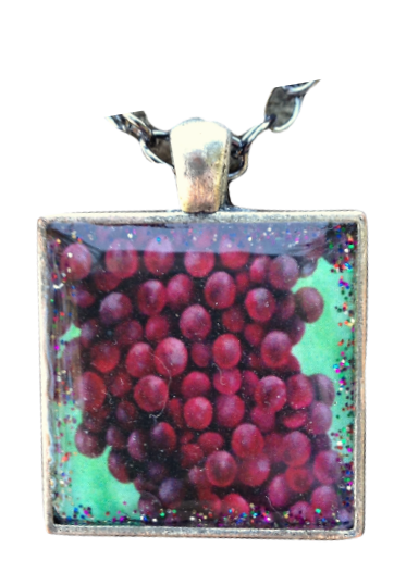
Zinfandel Square Pendant Structure Collection $109