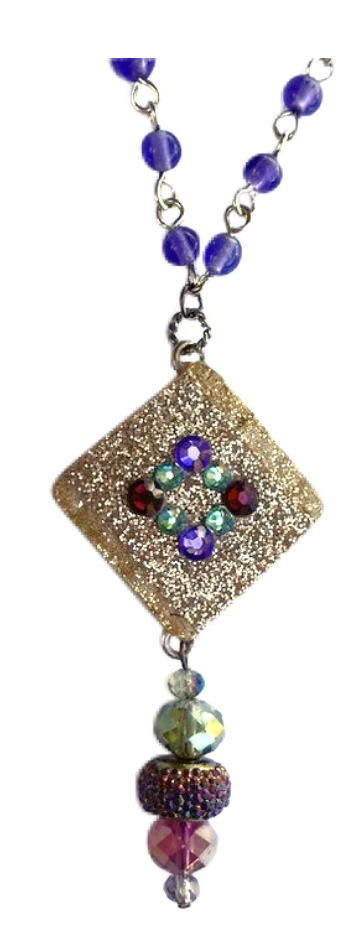
Peacock Mini Cork Necklace Cork Collection $129