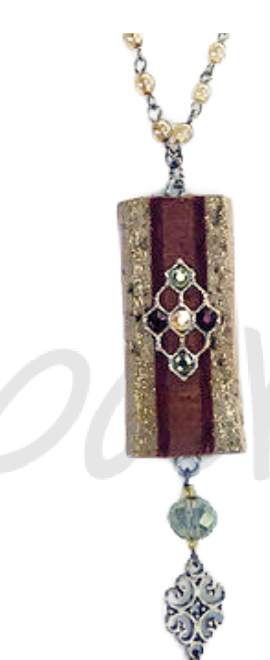
Burgundy Medallion Cork Necklace Cork Collection $149