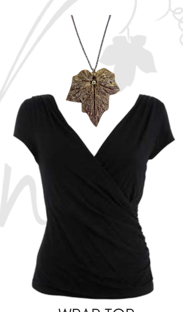
- WRAP TOP large angular pendant