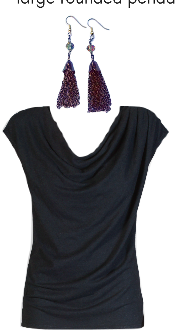
- COWL NECK long drop earrings