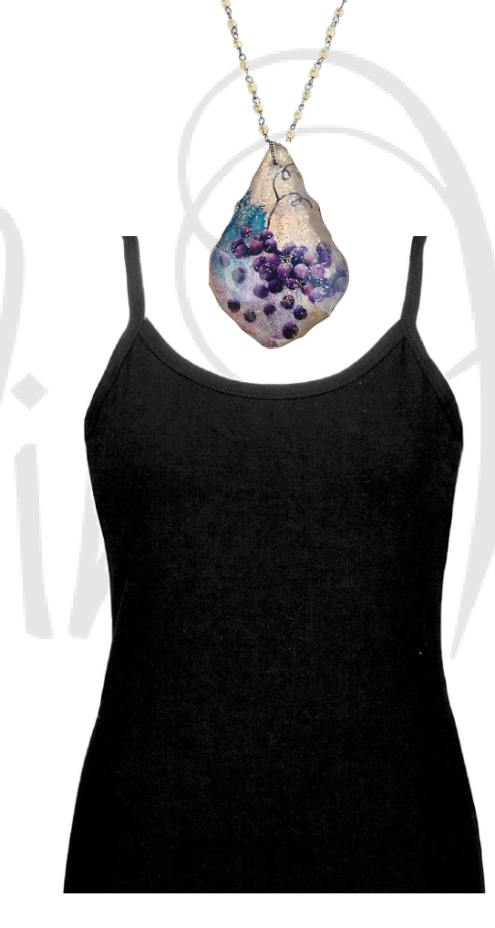
- SCOOP NECK large rounded pendant