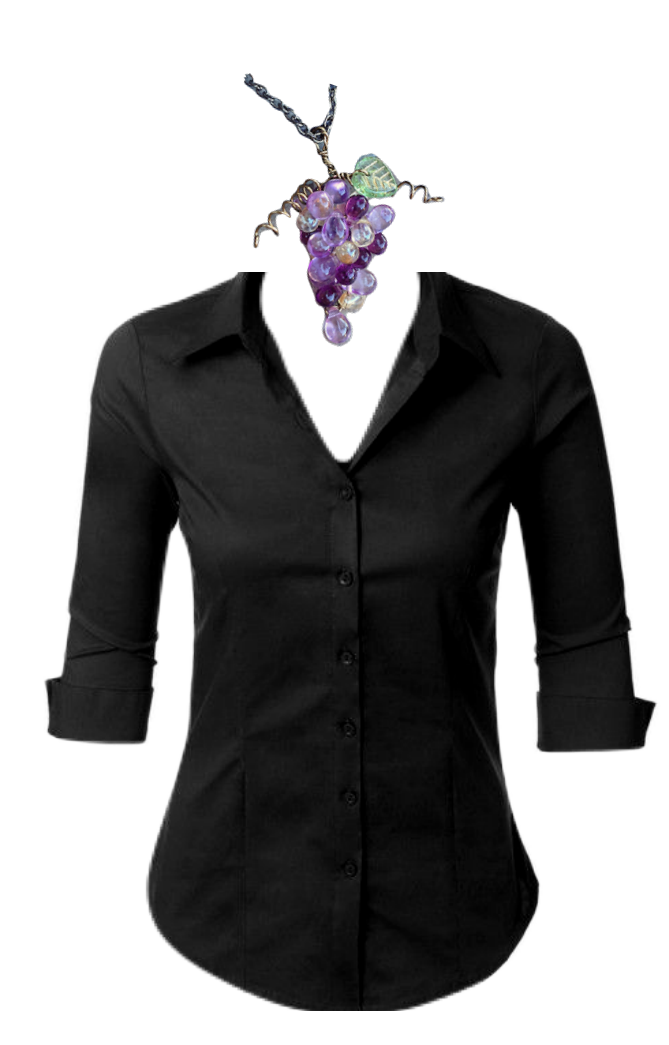
- BUTTON-UP small, short pendant