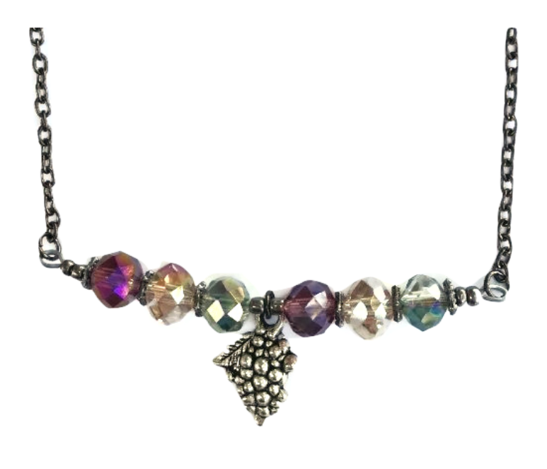
Varietals Bar Necklace Wine Bar Collection $79