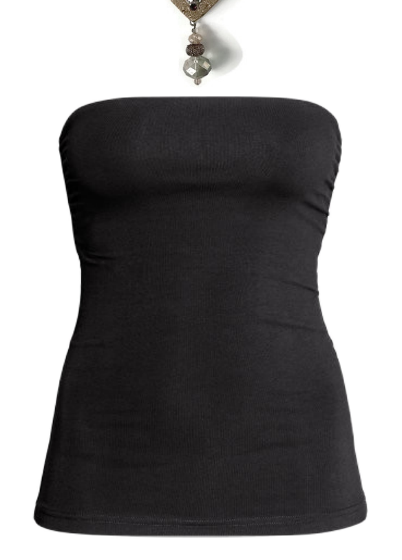
- STRAPLESS bold statement necklace