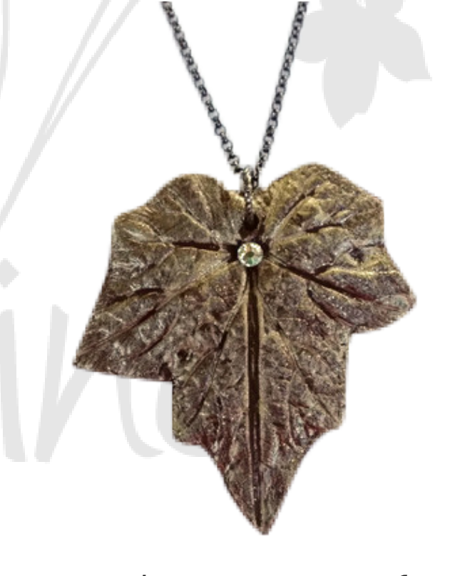
Clay Grape Leaf Harvest Collection $69