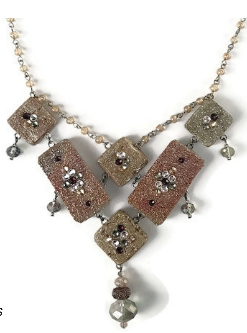
Cork Statement Necklace Cork Collection $349