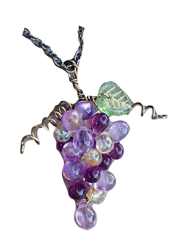
Pinot Cluster Pendant Harvest Collection $89