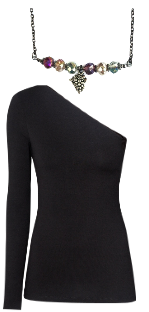
- ASYMMETRICAL choker