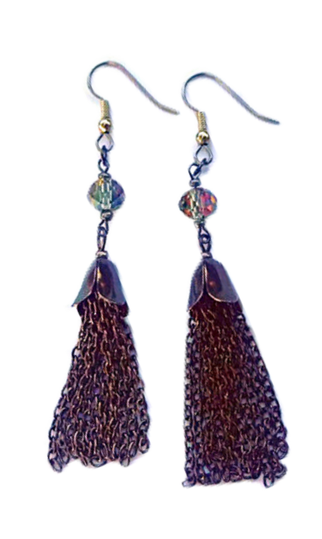
Iridescent Tassel Earrings Tasting Collection $55