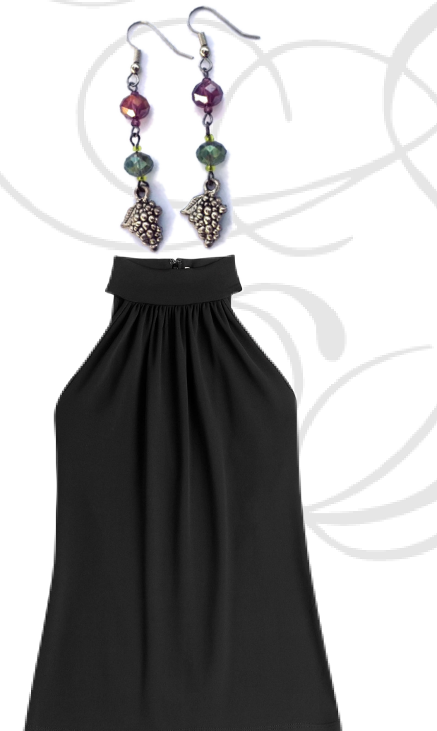
- HALTER long drop earrings