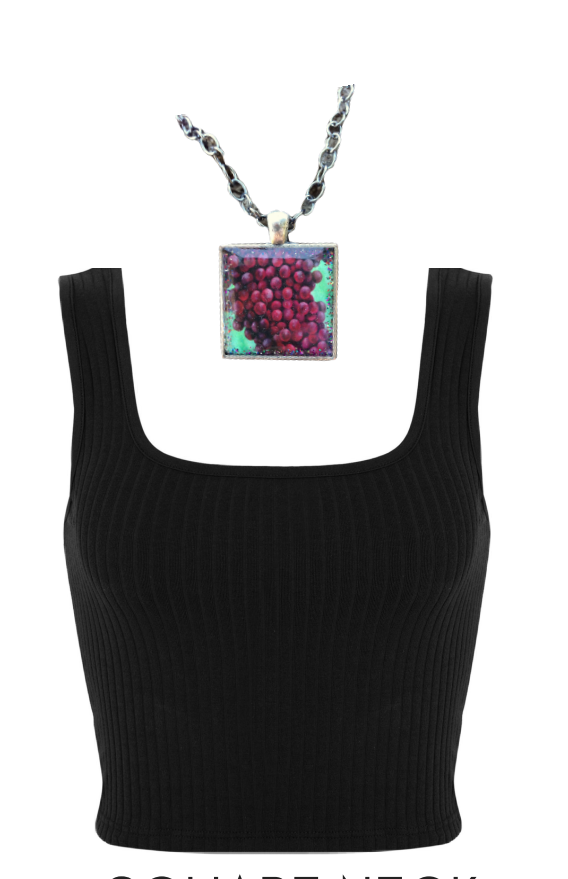
- SQUARE NECK square angular pendant