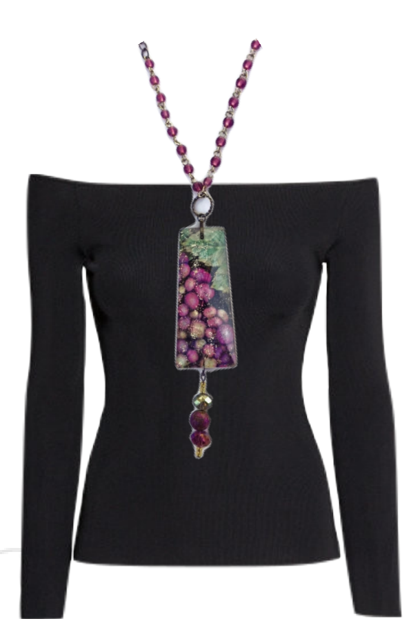
- OFF-THE-SHOULDER long vertical pendant