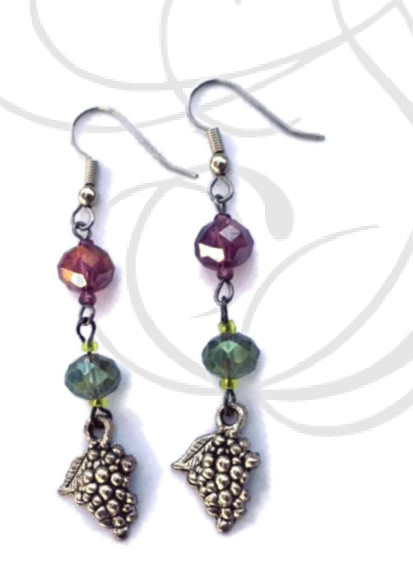
Amethyst Sage Grape Earrings Tasting Collection $49 B