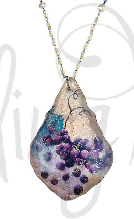
Spilled Grapes Crystal Crystal Collection e $109